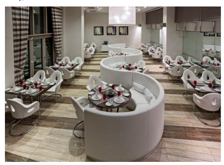
Figure 10. Circular oval style interior designs of Kaya Palazzo Golf Resort (projem.com, 2023)

In his study, Andersson stated that disadvantaged groups were seriously victimized, especially in the restorations of New York City and Bloomsbury Street, due to the concern of desexualizing and modernizing cities, and that urban lighting elements eliminated the ancient identity of the city and the street (Andersson, 2011, p. 1081-1082). It is important for urban equipment elements to be ergonomic, especially in terms of accessibility, and to reduce lighting and secluded places and blind areas in terms of security, in terms of urban unisexualization.