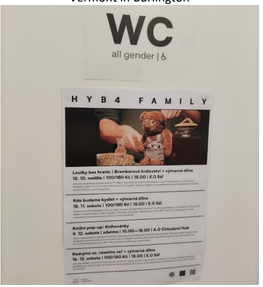
Figure 6 Example of common restroom in Czechia 2018

For example, yesterday's (30 years ago) young people who kept cattle in Turkey are today evolving into a Turkish Android generation that moves the primitive Renault Toros Brand 1985 model car with its voice and opens and closes its windows with simple digital remote-control. These evolutionary processes inevitably lead the people of tomorrow towards mental genderlessness or at least a tendency to think gender-neutral, with the genderless design motives potentially contained in technology.