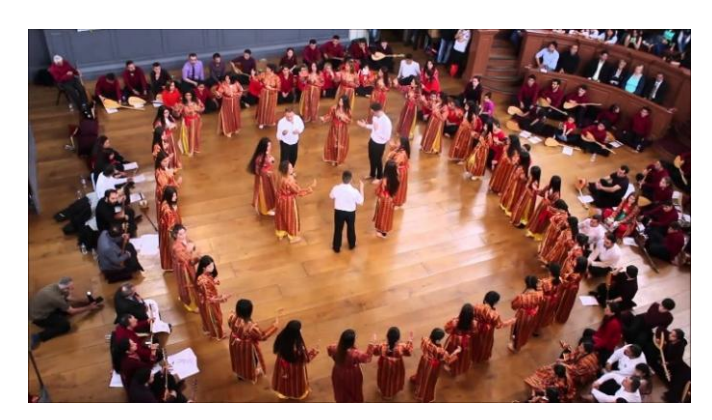
Figure 9. England Alevi Cultural Center and Cemevi Semah Team (Oxford University, 5th Alevi Festival Opening Reception (youtube.com, 2022)

Some rituals of many religions, especially the religion of Islam, which has a dominant influence in Turkish-Islamic societies, and the coexistence and interconnectedness of men and women in the places where these rituals or worship are performed, require that some urban public services and equipment in these places be designed with a genderless logic. Men and women are intertwined during the circumambulation around the Kaaba. This situation is extremely normal for the relevant religion. A similar situation is also seen in the rituals and worship in Alevi Cem Houses.