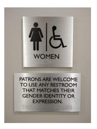
Figure 7. Example of common restroom on media (Openaccessgovernment.org, 2023)

In addition to Figure 5 and Figure 6, another example of gender-neutral toilets can be seen in Figure 7.