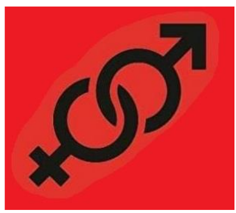
Figure 12. Symbol expressing the integrity and transitivity of gender.