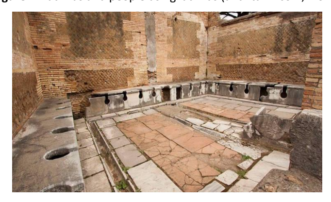
Figure 2. Indoor Latrinas (Baş, 2016)