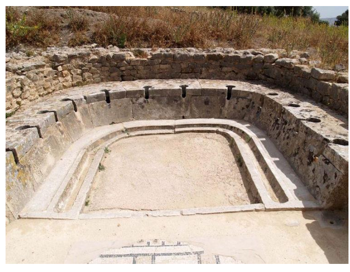
Figure 3. Outdoor latrinas (Baş, 2016)

Latrina: "The introductory article of the Magnesia Ancient City, located in the Germencik district of Aydın province, begins with "32 people met their needs at the same time" (Mert, 2020).