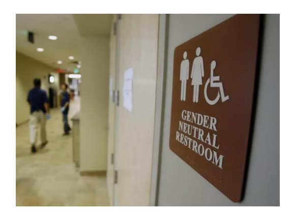
Figure 5: Newbery, L. 2022) gender-neutral restroom at the University of Vermont in Burlington