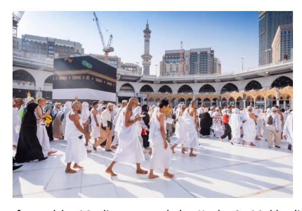
Figure 8. Tawaf moment performed by Muslims around the Kaaba in Makka

So why has gender neutralization become so important recently? The main reason for this is the reshaping of social structures mainly with technological effects, and in this shaping, especially the perceptions and tendencies in technological and artistic products that are unisex or not confined to sex.