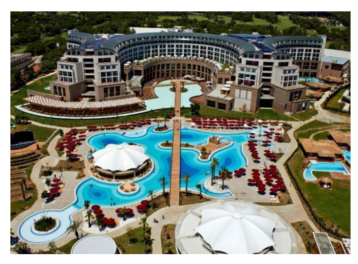
Figure 11. Circular oval style outdoor designs of Kaya Palazzo Golf Resort (projem.com. 2023)