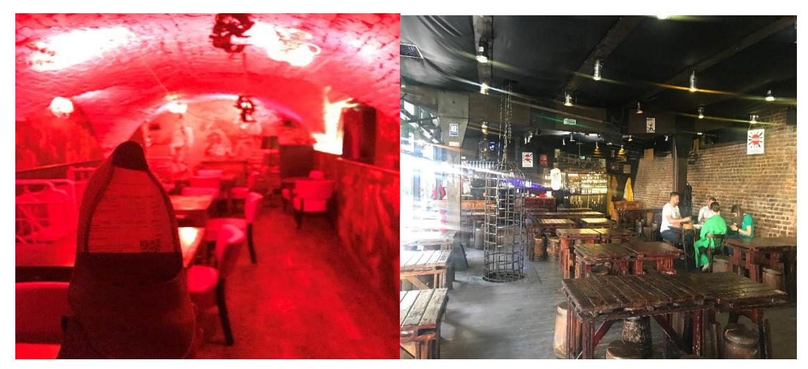
Figure 2. The lower floor service hall of Masoch cafe, and bringing a bill in a woman's shoe (left). A torture device (iron cage) used for entertainment in the Meat and Justice restaurant (right).

In the observations within the research, it has been seen that the themed restaurants attempt to offer their customers enjoyable experiences. Starting from the external appearance of the restaurant (guest welcoming and entrance) to taking orders and bills, shows during the meal, employees' clothes and setups, astonishing service ways (such as serving coffee with fire in the dark) aim to entertain the customers in general. Of course, such activities offer much more fun than a typical restaurant can do, and such restaurants can turn into entertainment centers for tourists. Below are some photos of the activities of the theme restaurants to entertain their customers.