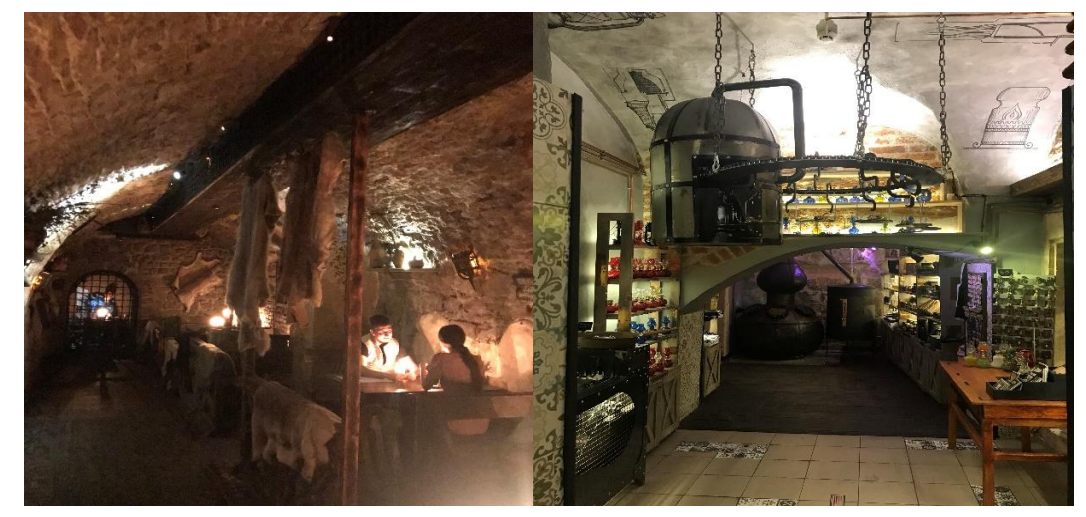
Figure 1. A part of 5th Dungeon service hall (left), Souvenir section of Gas Lamp restaurant (right).

Observations during the research also show that the atmosphere of themed restaurants provides memorable experiences. In fact, tourists' conversations, reactions (such as being surprised, tone of voice), and photographs or video recordings in the restaurants express their astonishment about the atmosphere. Below are the photos reflecting the atmosphere of the two restaurants that customers frequently highlight.