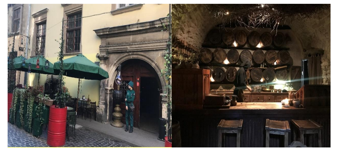
Figure 3. Gasova Lampa (Gaslamp) restaurant entrance and waiting staff (left), a staff member in Medieval age clothing at the 5th Dungeon restaurant (right). (Source: Taken by the author).