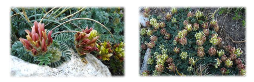
Figure 1. The photos of A. sibthorpianus