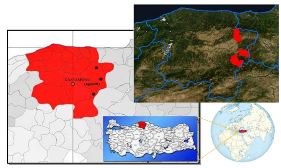
Figure 1. Location of the Study Areas on the Map of Türkiye

This study was carried out in Taşköprü, which is 44 km away from Kastamonu in Turkey (Figure 1). The silvicultural characteristics of the stands, soil properties, and geology were investigated in pure Kazdağı fir, Scots pine, and black pine-dominated stands around the town of Taşköprü.