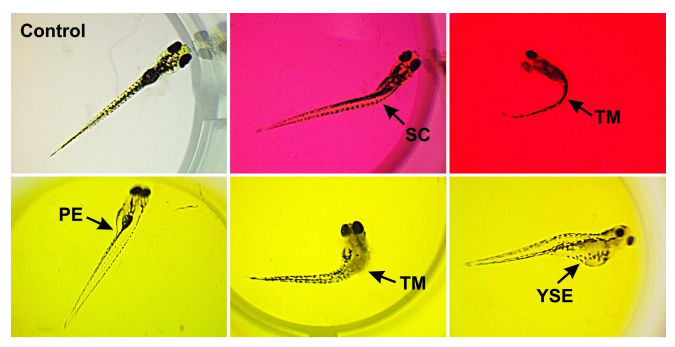
Figure 1. Microscopic images of embryos. Control embryos and Everzol Red LFB and Everzol Yellow CGL treatment groups 96h (SC: spinal curvature; TM: tail malformation; PE: pericardial edema; YSE: yolk sac edema)